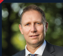
Dr Richard Harris SC OAM