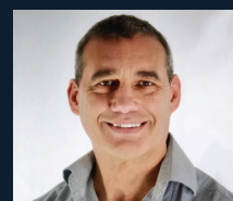
Dr Craig Challen SC OAM