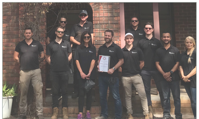
2018 Corporate Volunteers of the Year Hoskins Contracting, working on a soon-to-be-announced special project for 2019.